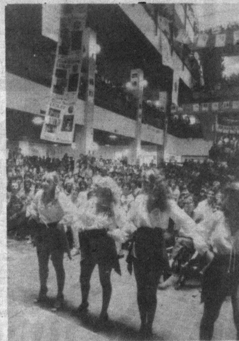
and a-one, and a-two, and a-three...

Engineering professors were on hand to judge the bands though most of the crowd turned out to get in on the rowdy atmosphere of fun and friendly competition.