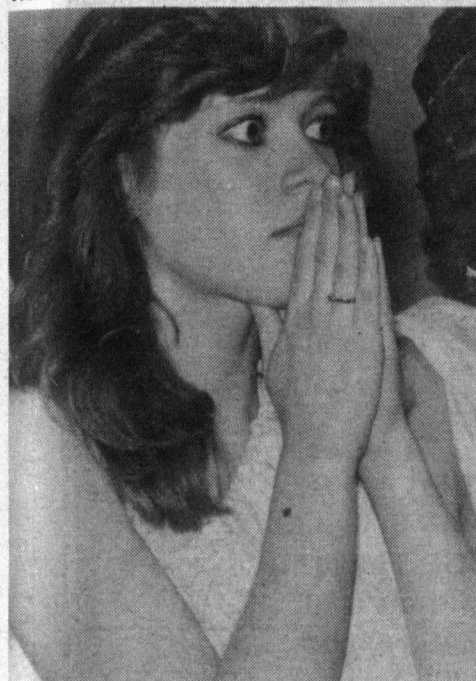
Oh, I hope they don't mob us.