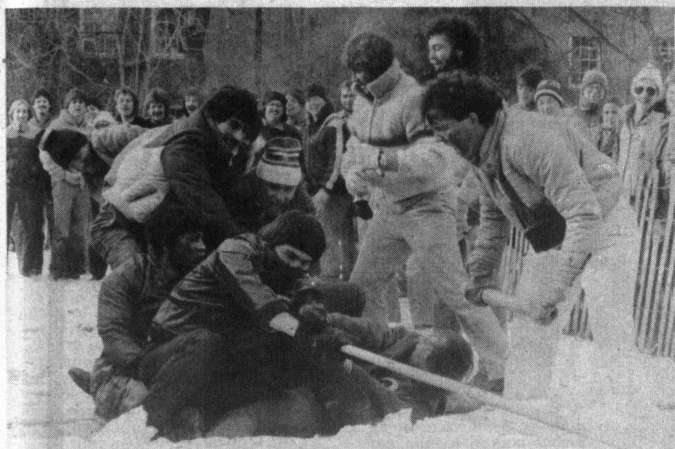
Jeez, these snow sculptures are sure heavy.