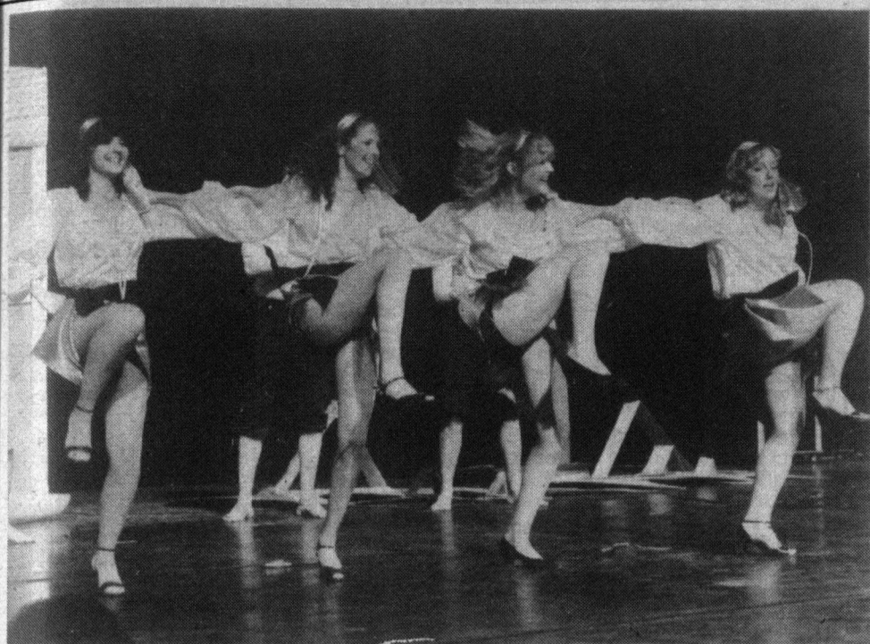
Here's the latest in aerobic dancing.