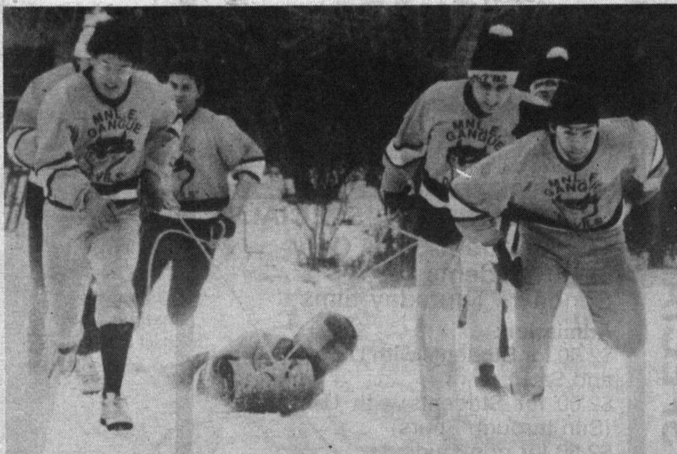
Good God, late for another class!