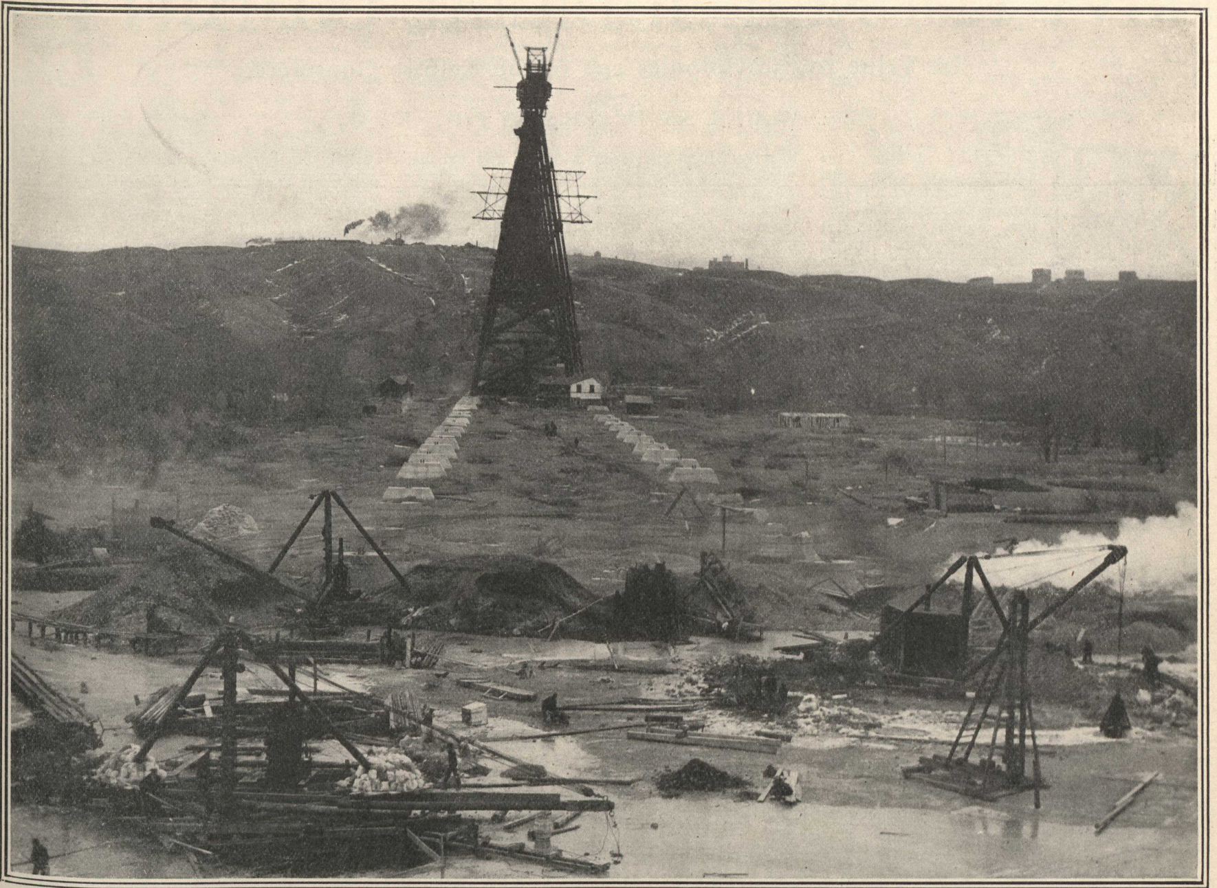
One of the largest Bridges in Canada now being built over the Belly River at Lethbridge, by the Canadian Pacific Railway.