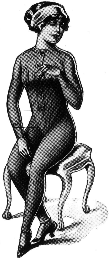
LIGHTWEIGHT UNDERWEAR MADE OF FINE YARNS

There are many women who can't wear all wool underwear and yet who do not want all cotton. For this class we offer a line of underwear made specially for Eaton customers. It is our special lightweight NeatonU combination, made of fine yarns, wool and cotton mixture, firm, smooth weave and flat seams. White, sizes 32 to 42.