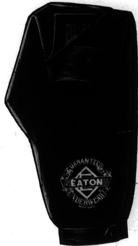
WOMEN'S FLEECE LINED BLOOMERS

This is a very popular line in Western Canada, particularly for driving. Made of fleece-lined stockinette, knee length, shaped band at waist and knees, and have drop seat. Exceptionally warm and heavy, affording the greatest protection from cold. As this line is such a big seller, we have taken extra precaution to have it in stock. But take no chances and order early. Grey or black; small, medium and large sizes.