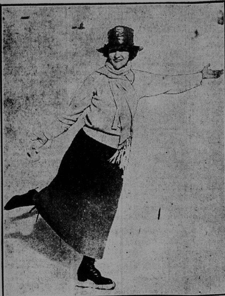
LADY ASTOR GOES SKATING—British Woman M.P. Enjoying Herself at St. Moritz, Switzerland.