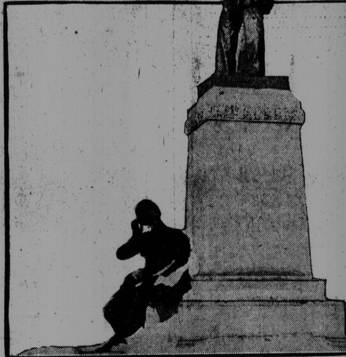
IRISH-CANADIAN STATESMAN HONORED—New Statue of D'Arcy McGee Erected on Parliament Hill, Ottawa. It Was Cast in Belgium Before the War and Buried to Save It From German Invaders.