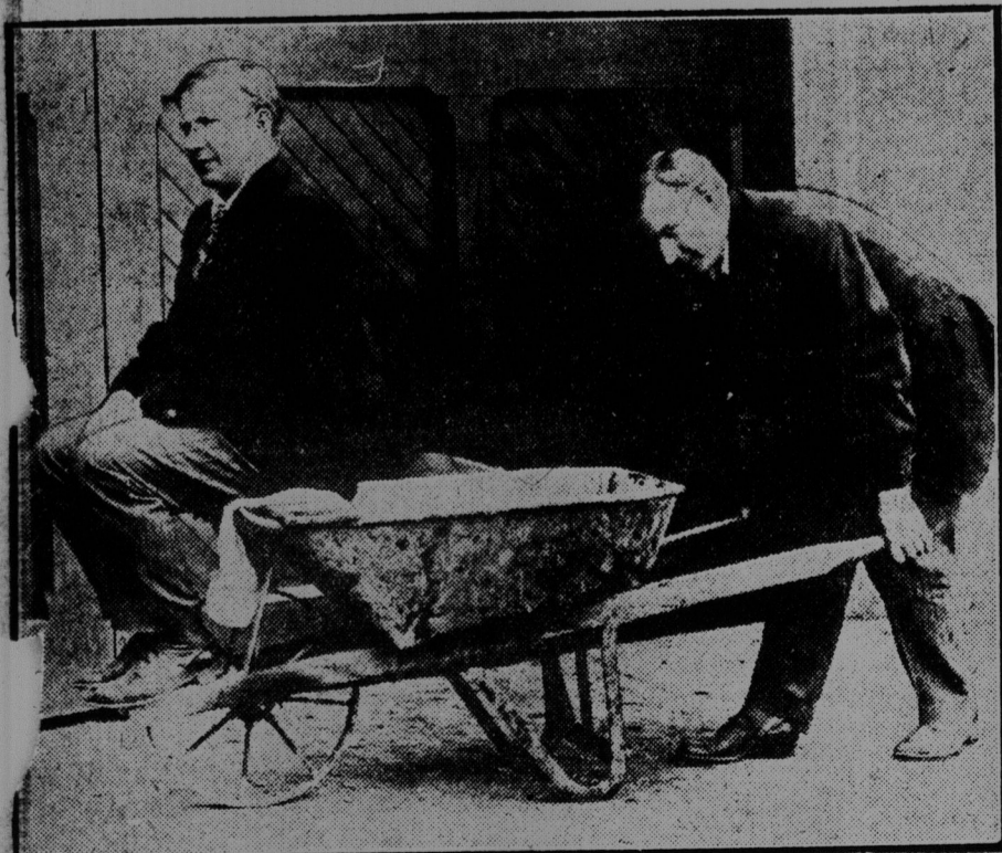
TAKES HIMSELF FOR A RIDE—Here is Where the Photographer's Double Exposure Confounds the Reader.