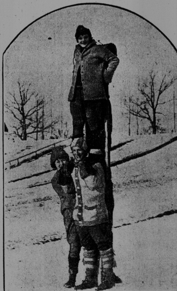
AN EXHIBITION OF THEIR OWN—Some Toronto Snowshoers Do "Stunts" in High Park.