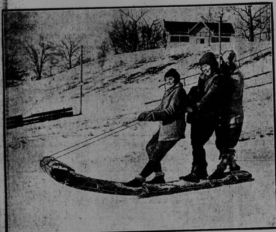
TAKING THE SLIDES STANDING—Canadian Girls Imbibe the Spirit of Strength and Adventure of the Cold Season.