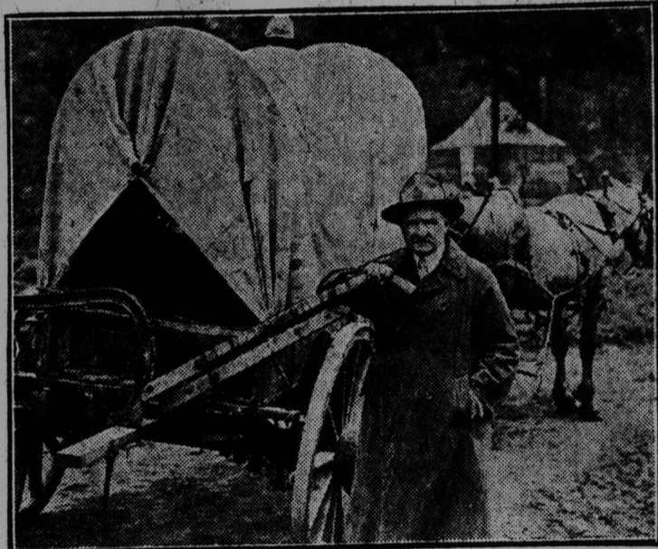
AN AUTHOR ON THE ROAD—Emerson Hough, Author of "The Covered Wagon," Which Has Recently Been Adapted for the Screen.