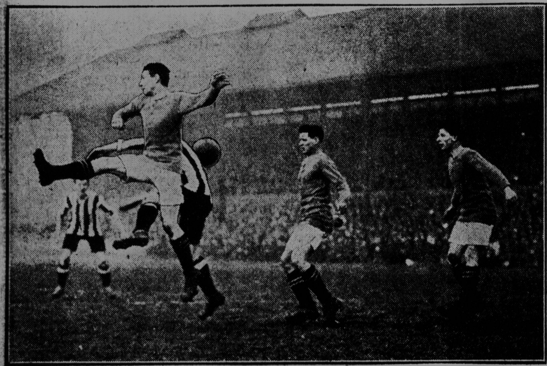
LOTS OF ACTION HERE—An Incident in Chelsea vs. Newcastle Football Game Recently in England.