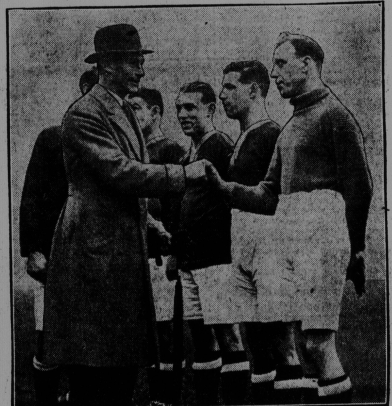
A BUSY ROYAL FIGURE—Duke of York Shaking Hands With Bathgate Football Players at Hampden Park.