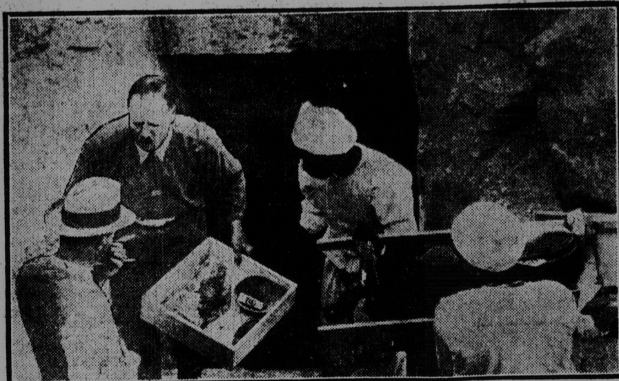
MORE TREASURES FROM VALLEY OF THE KINGS—A Tray of Relics Being Brought Up From the Tomb of Tutankhamen.