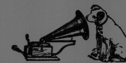
"HIS MASTER'S VOICE"

Nothing more delightful in the home than good music. THE VIO- TROLA, a perfect musical instrument, will bring to your fireside the best music of all the world. A Virola should be in your home this Xmas— ALL PRICES.