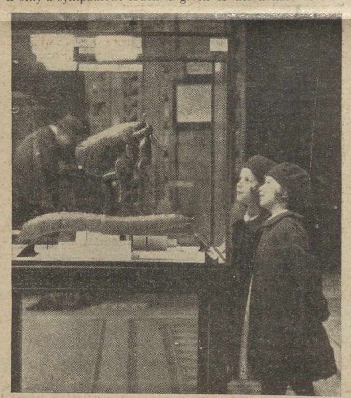
Children examining the anatomy of a flea at the National History Museum, South Kensington

have endeavoured to pass on, the knowledge and the inspiration that such a visit gives. Or go to the Natural History Museum at South Kensington, go upstairs to the first floor, and see there a single case, not four feet square, in which are exhibited dull and uninteresting rocks. One is instructed to press a handle lighting a quarte large. are exhibited dull and uninteresting rocks. One is instructed to press a handle lighting a quartz lamp, which brings out in a marvellous way some of the hitherto unknown glories of minerals. Grey rock, instead of being dull and uninteresting, becomes vivid and colourful—fluorspar glows bluish-violet, zincblende burns a fierce gold, calc-spar becomes sufficient with a label of the bardle grey pressure of the bardle grey pressure and hadden the bardle grey pressure. delicate rose-red. And then the handle slips back—grey predominates; but always one will remember that drab minerals are full of colour and can be made to glow with exquisite tints if only a sympathetic touch is given to the handle that the