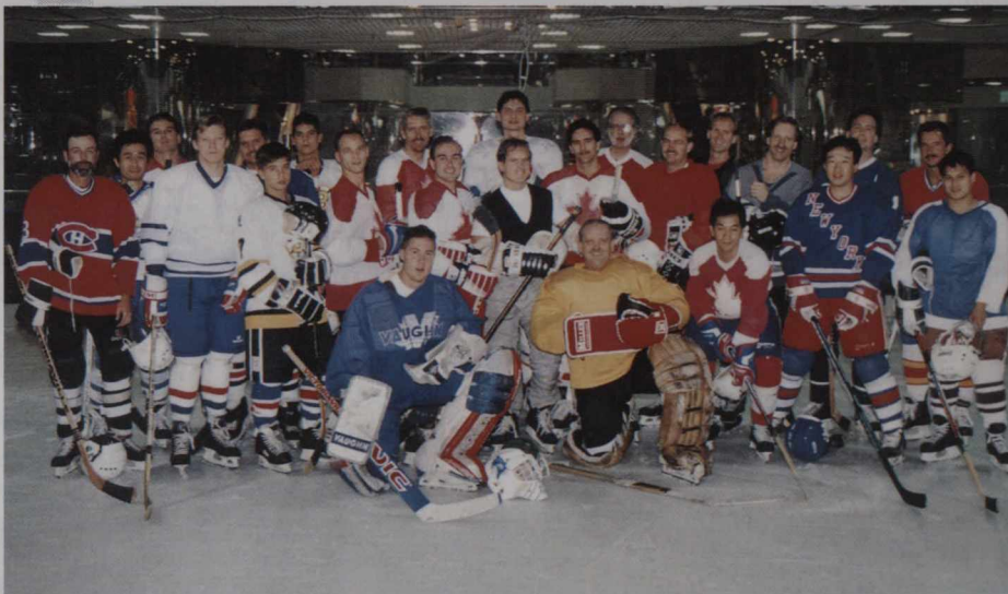
Members of the Can-Am Ice Hockey Association lace up skates and don pads for their weekly games.

The Can-Am club typically seeks out the best competition in the Pacific Rim by travelling to the likes of Thailand, China and Korea where it plays United Nations Command, U.S. army and Korean university club teams. Aging veterans on the squad, with faltering memories or perhaps outright disdain for factual accuracy, repetitively regale uninterested listeners with variations on the story of how in 1985 they rallied in the 12th period of overtime, knee-deep in slush, to defeat the Thai national team.