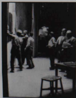
← Alec Guinness as Richard III in the coronation scene of the Stratford Festival's inaugural production of Richard III, 1953, directed by Tanya Moiseiwitsch.