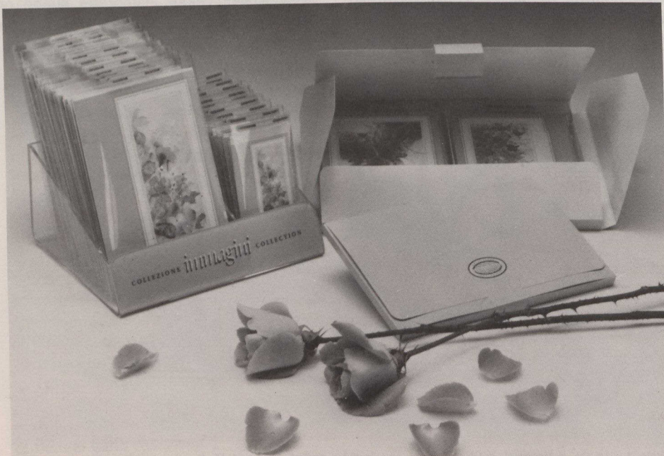
Notecards and gift enclosures from Immagini Fine Papers of Vancouver

Umbra Shades Limited of Scarborough, Ontario manufactures vinyl tabletop and gift products such as coasters, place mats and soft vinyl wall clocks. The company's original line of products provide accents of bright splashes of vibrant reds, blues and yellows. They have become increasingly popular and are marketed nationally and internationally.