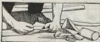
Repairing a tube with the Goodyear Tire Repair Kit

To supplement his work, we will gladly send you, free, our Tire Conservation Course. Write us at Toronto for this course.