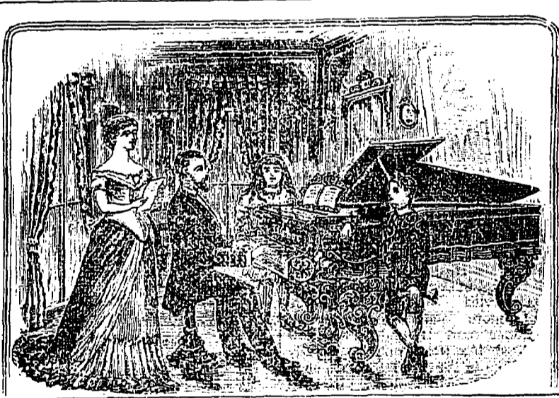
THE WEBER BABY GRAND. RECEIVED HOME.