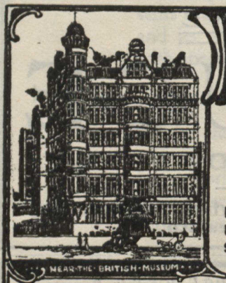
Kingsley Hotel—"Bookcraft, London."

R. Paterson & Sons, Coffee Specialists, Glasgow.