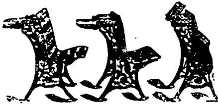
THE "MARVEL" SCHOOL DESK,

W. STAHLSCHMIDT & CO., PRESTON, ONTARIO. Manufacturers of Office, School, Church and Lodge Furniture.