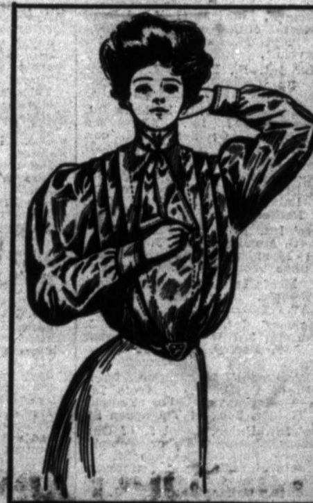
No. Aa 925

Every woman can test her good judgment by buying one