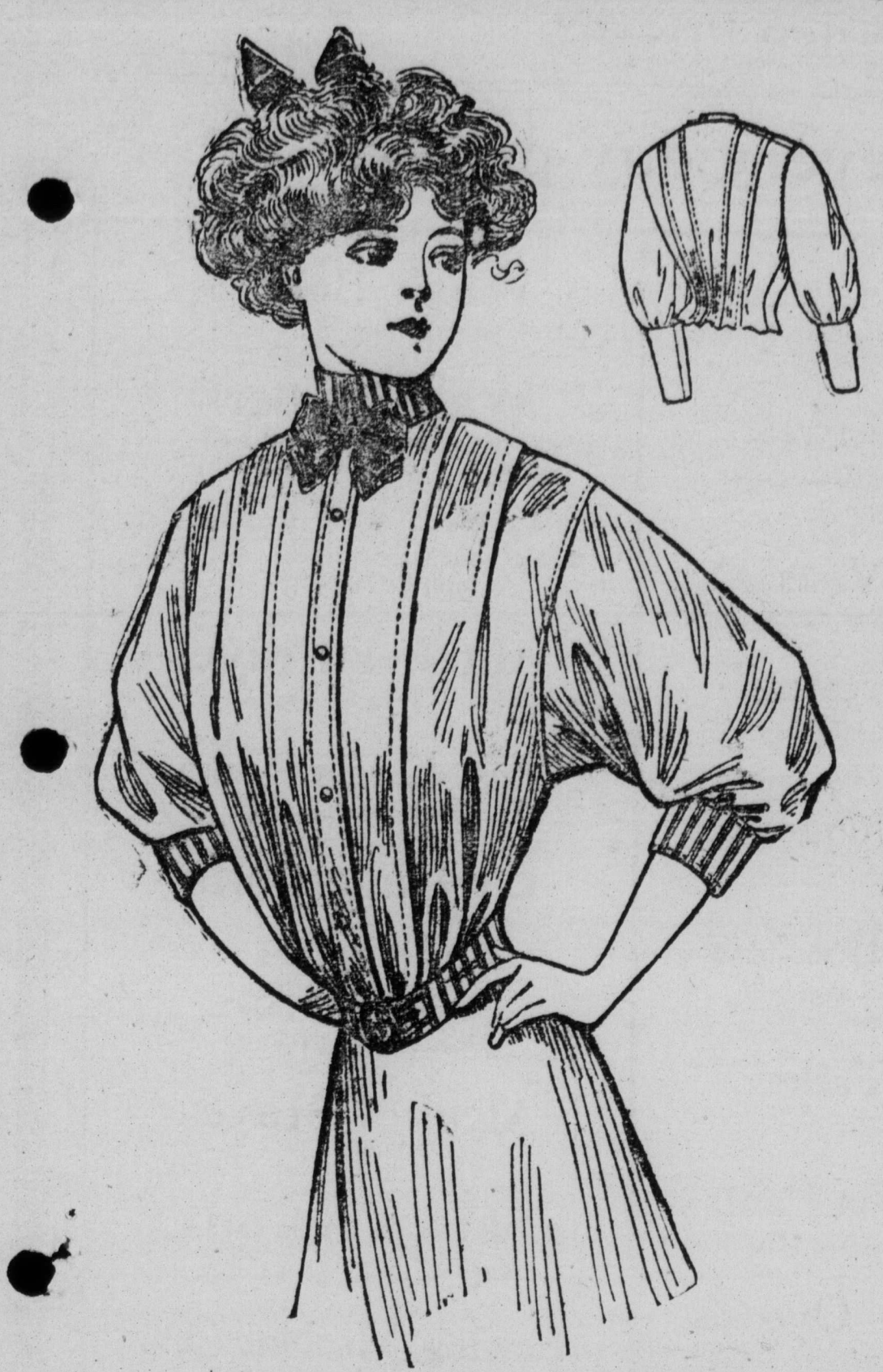
FIG. C-FASHIONABLE KIMONO BLOUSE.

able are past and gone. While the have it dyed to match. The long, material of the blouse need not be mousquetaire sleeve in this model is like the skirt, it must match in color, charming made up in soft materialsand is really a part of the dress itself. Irish or Cluny lace should make the The day of the pleated skirt is de- bretelles and yoke. The woman who cidedly over, and by fall it will be seen has a pretty throat could eliminate the very little on the woman of fashion. high standing collar and cut the throat Some conservative tailors say, however, out in the prevailing Dutch neck fashthat the pleated skirt will always be ion. The blouse is particularly becomworn by a certain type of woman- ing to the slender girl, as it gives presumably the tall, thin type. But breadth over the shoulders and fullness certainly the gored and circular skirts over the bust. are just now riding on the top wave of Figure B is a most practical model