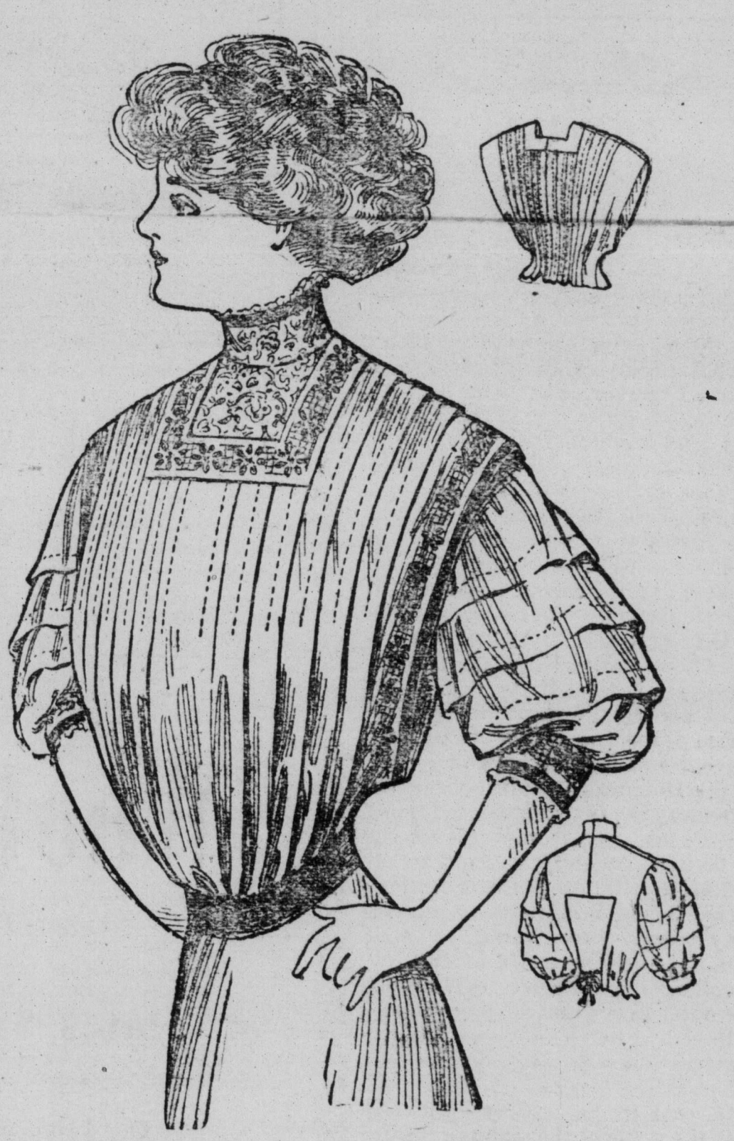
FIG. E-FANCY BLOUSE WITH GUIMPE.

. FIG, A-LIBERTY SILK BLOUSE WITH TASSELS.