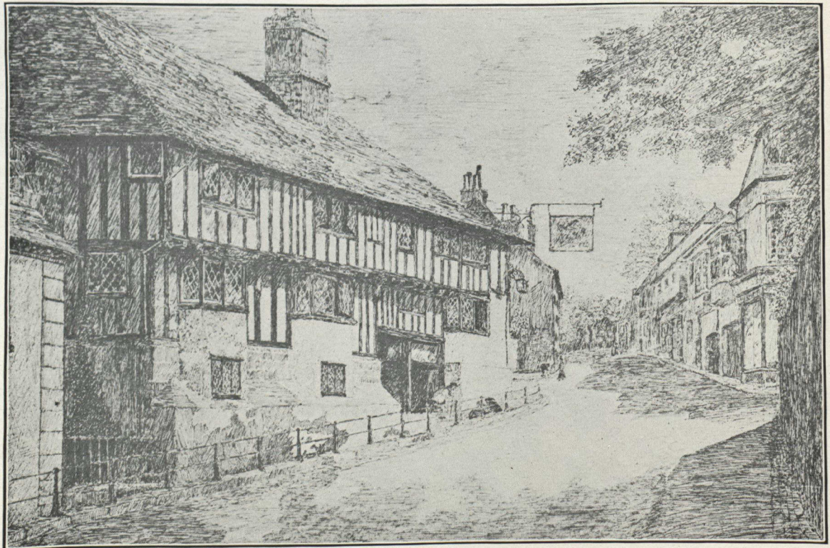
"THE LAMB INN, EASTBOURNE."