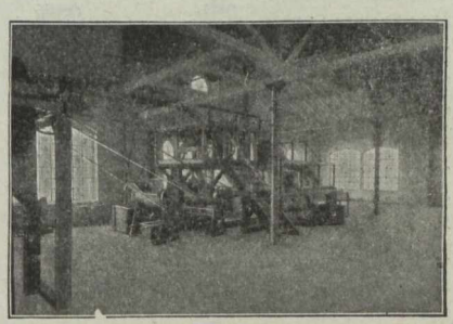
Krupp Ore Testing Plant at Magdeburg

The reports are forwarded, and, if desired, with samples of the concentrates, etc., without any restriction and the customer is at liberty to buy the machinery wherever he pleases. Naturally the Krupp Works desire a chance of competing with the other makers of ore dressing and metallurgical machinery once it is decided to erect a plant, but no obligation exists in this direction.