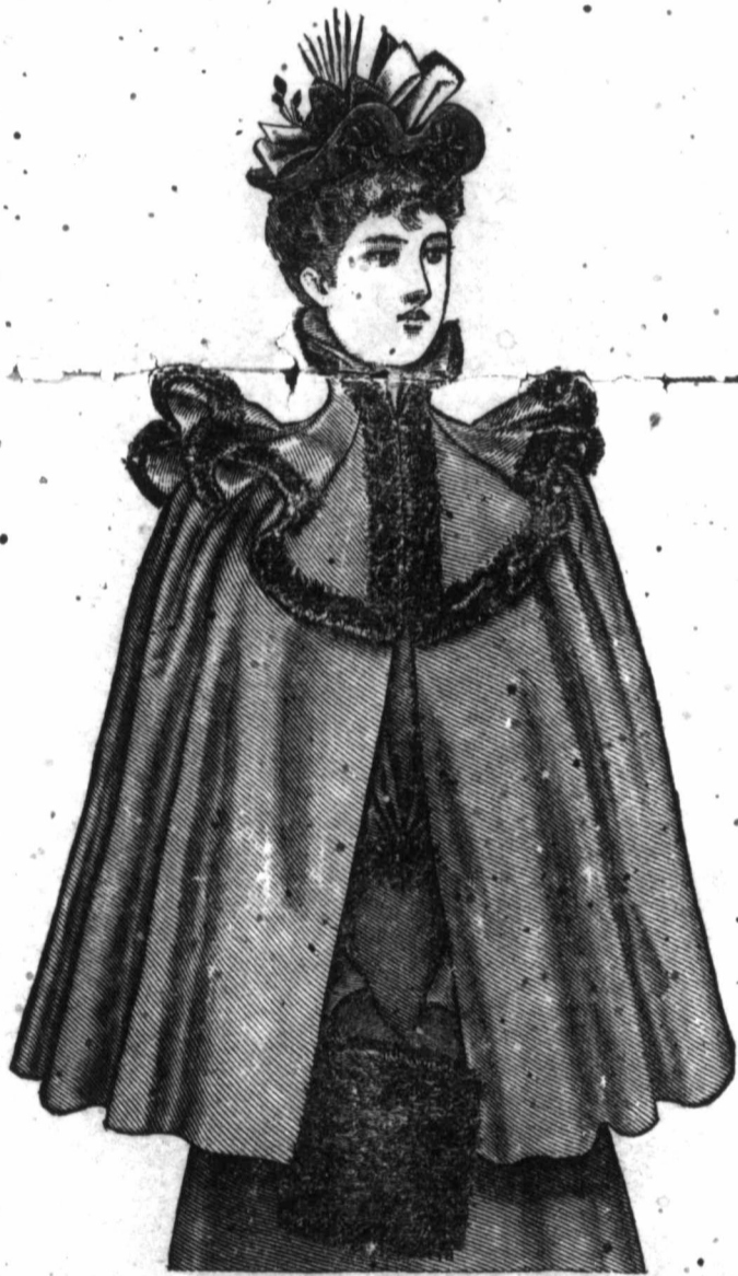
FIGURE No. 242 G.—LADIES' CAPE. FIGURE No. 242 G.—This portrays Ladies' cape No. 6655 (copyright), also pictured on page 6. The pattern is in 10 sizes for ladies from 28 to 46 inches, bust measure, and costs 25 cents. For a lady of medium size, the cape needs 6\frac{1}{4} yards of goods 22 inches wide, or 3\frac{3}{8} yards 44 inches wide.

THE T. EATON CO. LTD Dry Goods, Carpets, Housefurnishings WALL PAPER, CLOTHING, SHOES, ETC. 190 YONGE ST. - - TORONTO