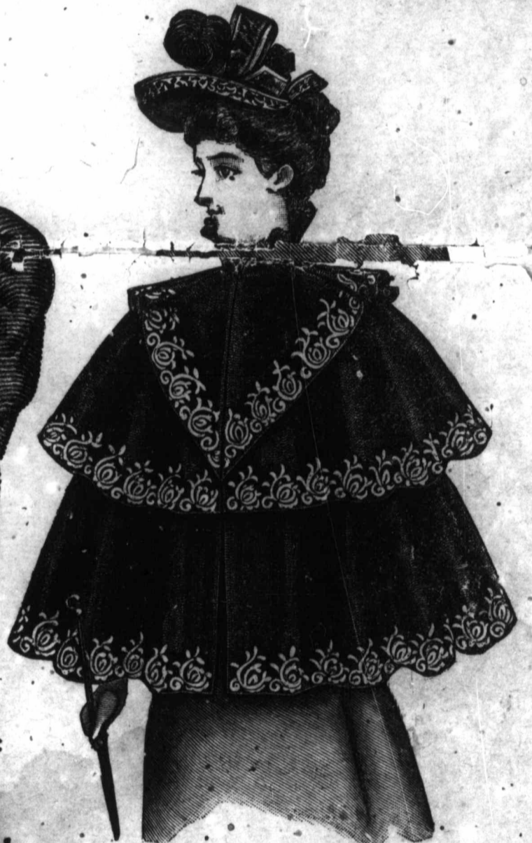
FIGURE No. 241 G.—LADIES' CAPE. FIGURE No. 241 G.—This illustrates Ladies' cape No. 6638 (copy'r't), also shown on page 5. The pattern is in 10 sizes for ladies from 28 to 46 inches, bust measure, and costs 25 cents. For a lady of medium size, the cape will require 6\frac{3}{8} yards of material 22 inches wide, or 3\frac{3}{8} yards 44 inches wide, or 3 yards 64 inches wide.