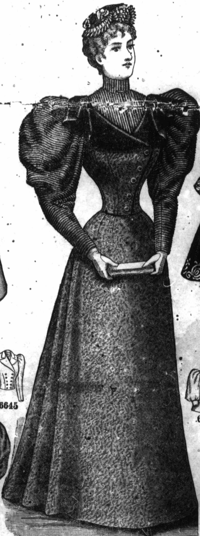
FIGURE No. 228 G.—LADIES' TOILETTE. FIGURE No. 228 G.—This consists of Ladies' basque-waist No. 6648 (copy'r't), on page 3; and half-circle skirt No. 6664 (copy'r't), on page 7. The waist pattern is in 13 sizes for ladies from 28 to 46 inches, bust measure, and costs 25 cents. The skirt pattern is in 9 sizes for ladies from 20 to 36 inches, waist measure, and costs 30 cents. Of one material for a lady of medium size, the toilette needs 11\frac{1}{4} yards 22 inches wide; the skirt requiring 6\frac{3}{8} yards; and the waist, 4\frac{3}{8} yards.