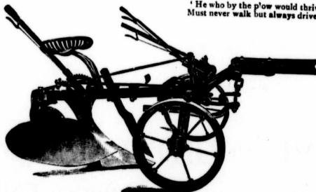
Ontario Riding Plow No. 3.

The Perrin Plow Co., Limited Smith's Falls, Ontario