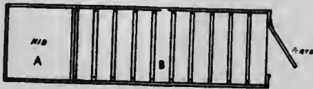
Floor of the hutch A—Close boarded section with a gentle slope. B—Open-work section.

Hutches for market rabbits should be two feet and a half ( 2\frac{1}{2} ) high.