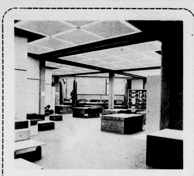
8 September 17, 1970