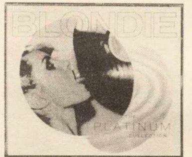
Blondie The Platinum Collection EMI 8/10

"I saw you standing on the corner/You looked so big and fine/I really wanted to go out with you/So when you smiled, I laid my heart on the line..." So begins "X Offender" and The Platinum Collection which is a brilliant best of Blondie collection which clocks in at over 150 minutes.