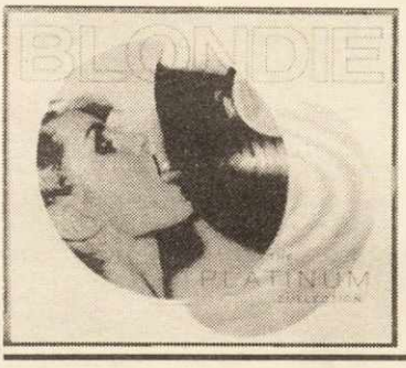
Blondie The Platinum Collection EMI 8/10

"I saw you standing on the corner/You looked so big and fine/I really wanted to go out with you/So when you smiled, I laid my heart on the line ... " So begins "X Offender"