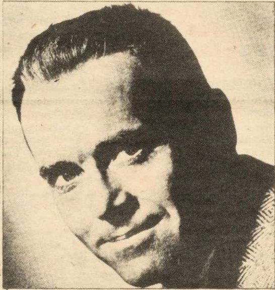
Hitchcock's "everyman," Henry Fonda. You can see the danger that the old adage about "being in the wrong place at the wrong time" is referring to in The Wrong Man playing at the Wormwood.

Remember, you can drop your quiz off at the Gazette office or the SUB information desk. Deadline is noon Wednesday following the publication of the quiz.