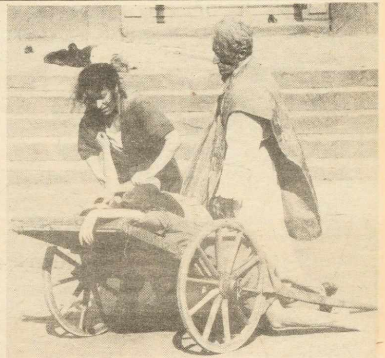
The Bishop is aided in removing bodies from the village cathedral bombed by Germans in a scene from Paolo and Vittorio Taviani's The Night of the Shooting Stars playing at the Rebecca Cohn Auditorium this Sunday at 8 p.m.