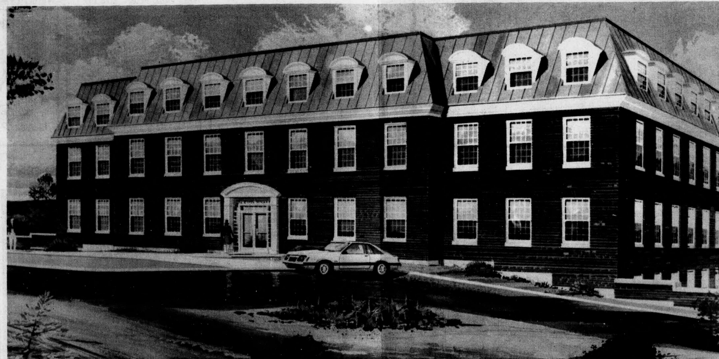
Singer Hall as it will look by September. Facing Harriet Irving Library, the addition to Tilley Hall will be a head quarters for the faculty of administration and the department. The university needs $1 million to complete the $3.3 million facility. DRAWING: Mott, Myles, and Chatwin, architects.

Proceeds raised from the sale of T-shirts and other items, pledges by students and the Dance-a-thon will go toward completing construction and providing such classroom necessities as desks, chairs, drapes, computers and tables.