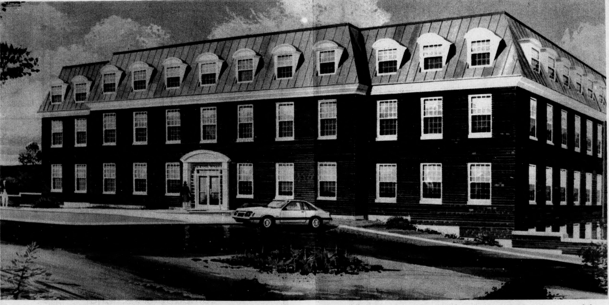
Singer Hall as it will look by September. Facing Harriet Irv ing Library, the addition to Tilley Hall will be a head quarters for the faculty of administration and the department. The university needs $1 million to complete the $3.3 million facility.

Proceeds raised from the sale of T-shirts and other items, pledges by students and the Dancea-thon will go toward completing construction and providing such classroom necessities as desks, chairs, drapes, computers and tables.