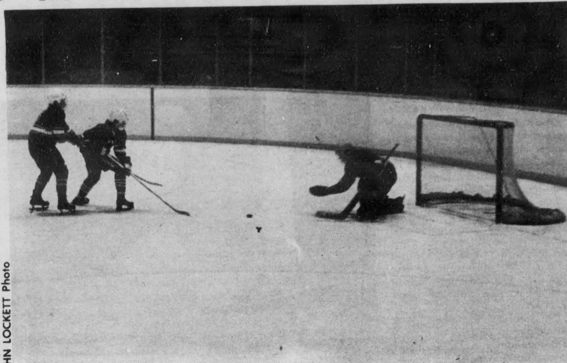
An unidentified Red Blazer attempts to score during a game from the tournament last week end.

The entire Red Blazer organization should be congratulated for running such a fine tournament. Special thanks should also go out to all those who gave so kindly of