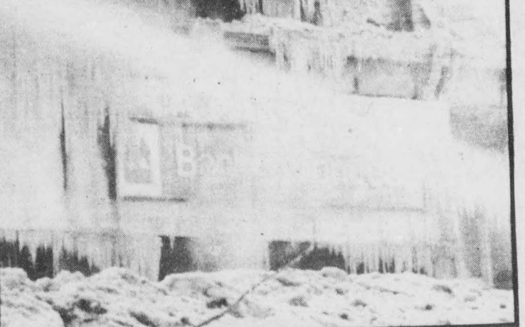
Firepersons fought a blaze at the premises of the Smoke Shoppe Bank of Montreal, Canadian Acceptance, 18 apartments, a dentist and beauty shop for 30 hours beginning the night of December 30.