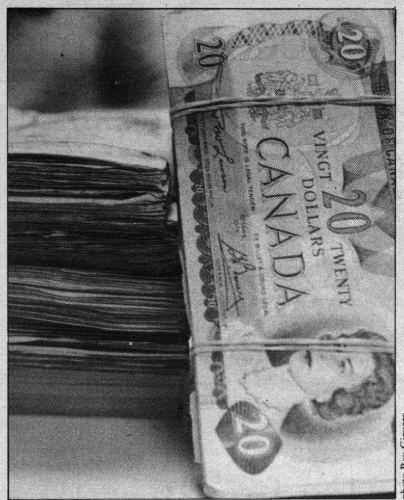
All this can be yours if you can convince SSHRC.