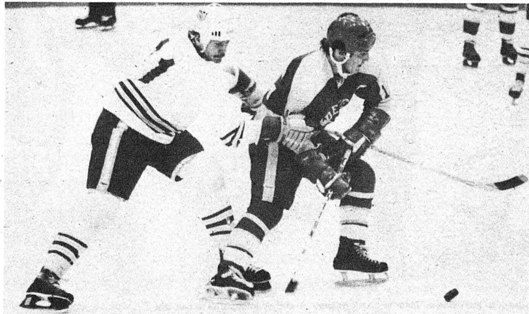
The hockey Bears won the Pacific Rim Tournament more through force of habit than anything else.