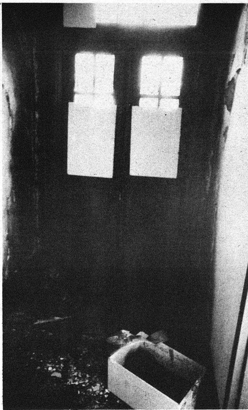
The Pembina pyro may have only been a graduating student who got carried away in disposing of old papers.