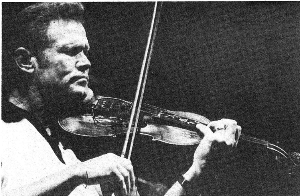
Vassar Clements proved that a bluegrass fiddler can rock and roll with the best of them.