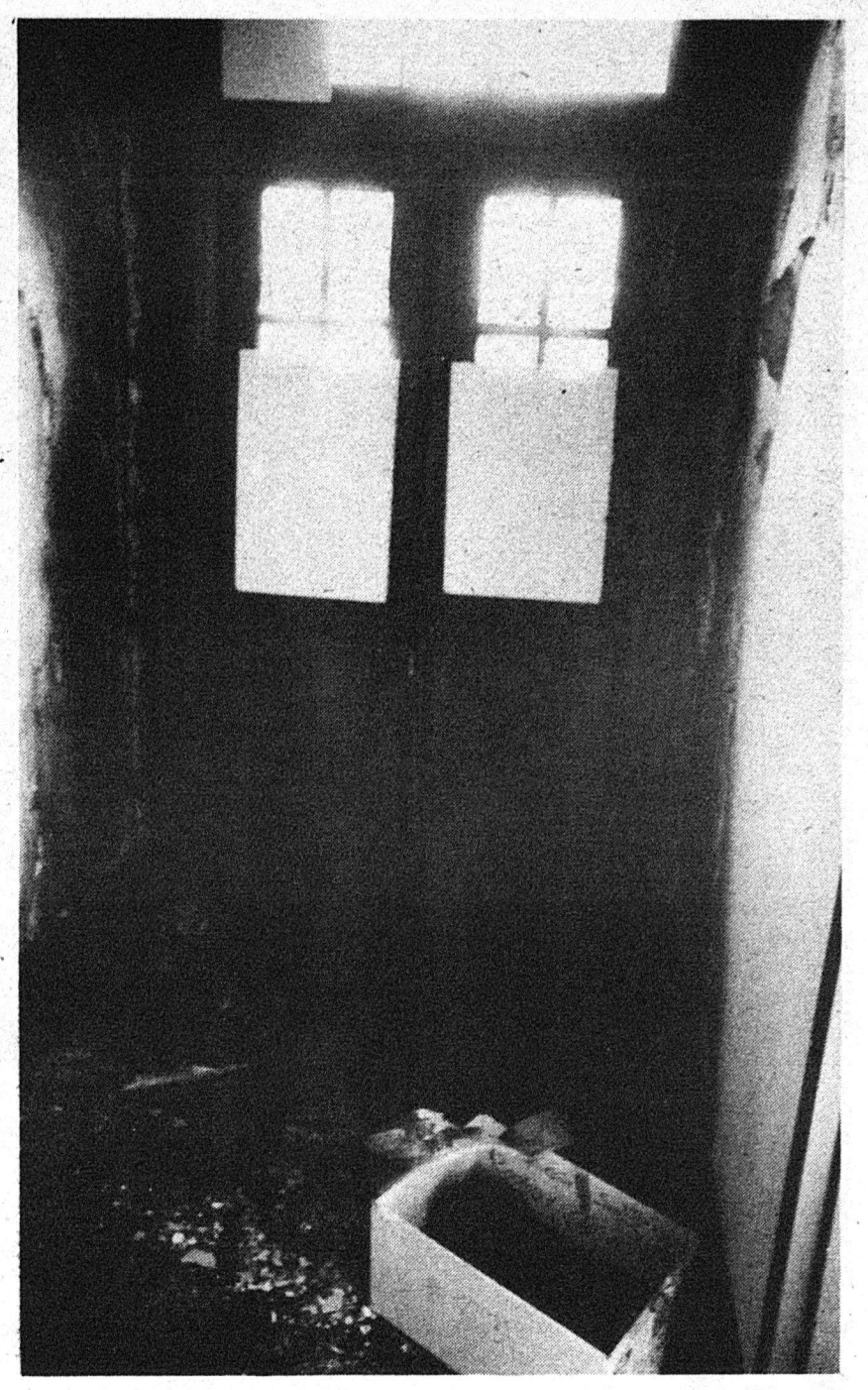
The Pembina pyro may have only been a graduating student who got carried away in disposing of old papers.