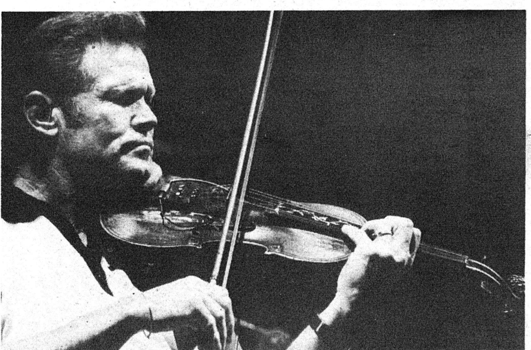
Vassar Clements proved that a bluegrass fiddler can rock and roll with the best of them.