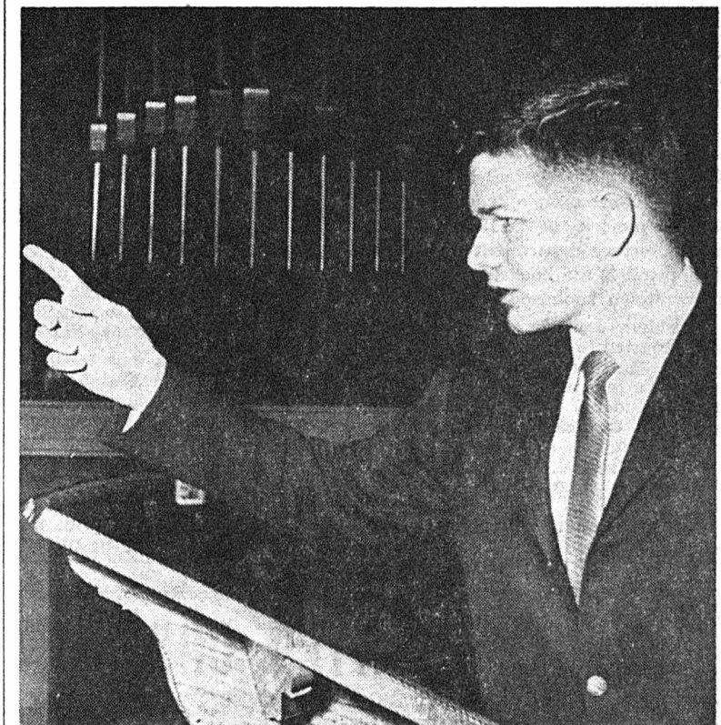
PIPES BEING EXERCISED by visiting Saskatchewan debater during McGoun final in Convocation Hall.

This is the fourth time in six years that U of A has won the McGoun Cup. Last year the cup was won by