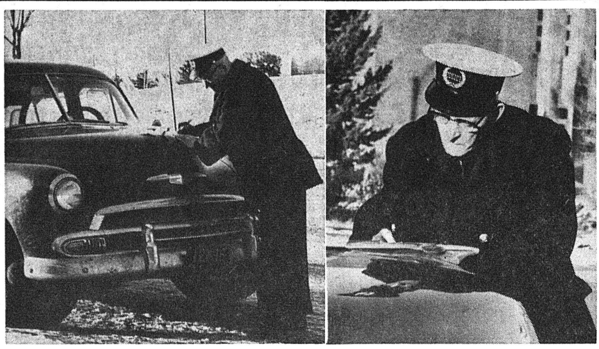
WARMING HIS HANDS and a student's heart, a campus copper issues a summons and seeks a promotion for his efficiency as a misery