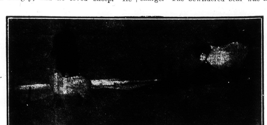
"In a few moments the little procession disappeared in the woods."