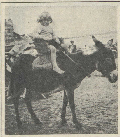
"You feel very brave sitting up so high in your wobbly basket seat."

"Please, I want a donkey ride" you say, and with that he swings you up into the little chair on the donkey's back and you pick up the reins and off you go. You feel very brave sitting up so high in your wobbly basket seat; it gives you little thrills down your back when you think how dangerous it is. It must be dangerous, for nurse said "do be careful,"