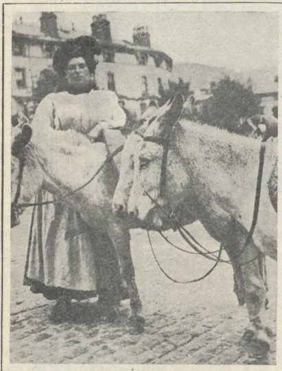
A London Coster Woman and Her "Mokes." riding the donkeys up and down the beach.

If ever your English cousins come over to Canada to pay you a visit, ask them to tell you about the holidays they have spent on the sea shore and especially about the donkey rides the children so delight in over there. In the summer time the English beaches are thronged with young people, running about in the warm, clean sand, in their bare feet, building mud castles, digging with their sand shovels, gathering shells in their bright-coloured tin pails, and best of all, rid-