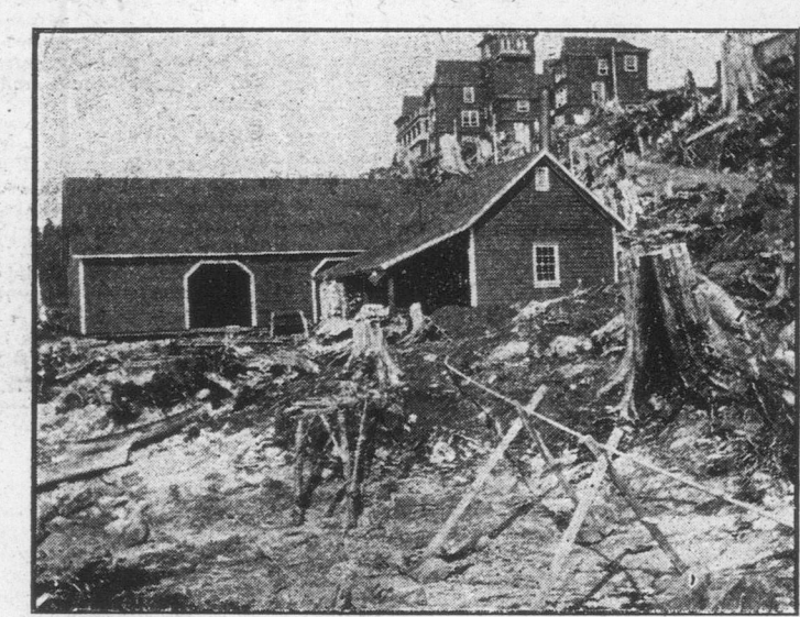
PUMPING STATION AT BAMFIELD CREEK

der to see the working of her lungs. to suppress the outbreak in the vilavet Porte telegraphed to Washington asking reach the district, even more appalling to have the American squadron recalled atrocities will be committed. The infrom Beyrout, but the request was 1e- surrection in Eastern Macedonia is pro-