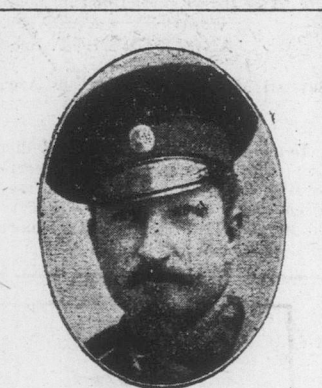
PRINCE FERDINAND OF BULGARIA