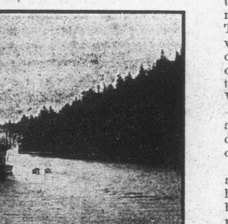
IRIS LAYING CABLE.

points, which at first was intended to be utilized altogether as the means of com-munication, gave considerable trouble The line was constantly being interfered with through breaks occurring in it. To vercome this it was decided to lay a cable to take the place of the most oublesome part of the land line across Vancouver Island.