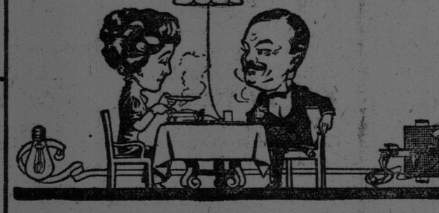
Westinghouse Toaster Stoves Toasts, Boils and Frys - - - $7.50 each