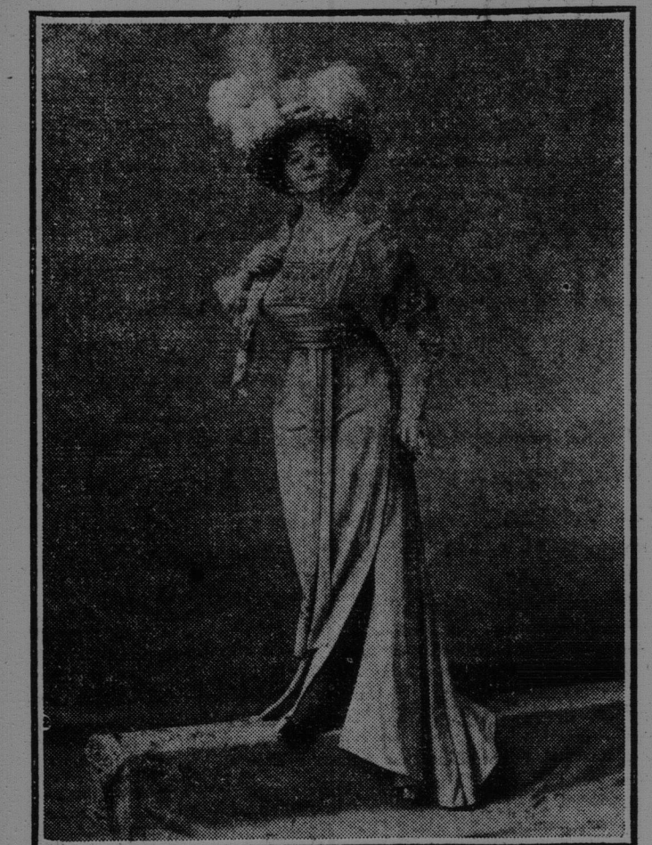
THE SHEATH SKIRT NEED NOT BE IMMODEST.

The burning question as to whether or not the American woman will adopt the sheath skirt is yet to be solved. Certainly in some of its developments it is exceptionally beautiful as well as artistic. These skirts are cut in one piece when developed in the wide broadcloths. Silk-fin ished cashmeres and satins. Around the bottom they measure less than three yards, but owing to the leeway allowed by the opening is either fastened blindly from the short wastline to a trifle below the knee, or is drawn together at intervals with military ornaments of chenille or fancy braid.