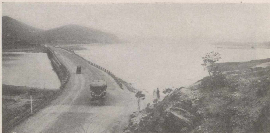
Fig. 26 illustrates a portion of the Government highway between Dairen and Port Arthur