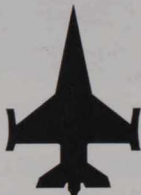
F-16 General Dynamics