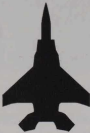
F-15 Eagle McDonnell Douglas