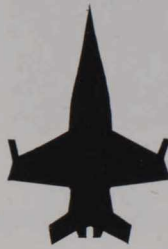
F-18 Hornet McDonnell Douglas and Northrop