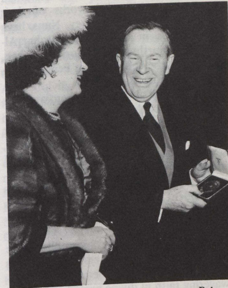
The late Lester B. Pearson, former Prime Minister, shows his Nobel Peace Prize, won in 1957, to his wife Maryon.

high speed rescue boats and are trained to man them, and assist rescue organizations in the Straits of Juan de Fuca.