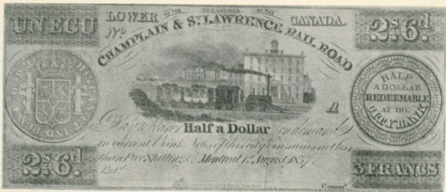
ONE OF THE FIRST CANADIAN RAILWAY TRAINS