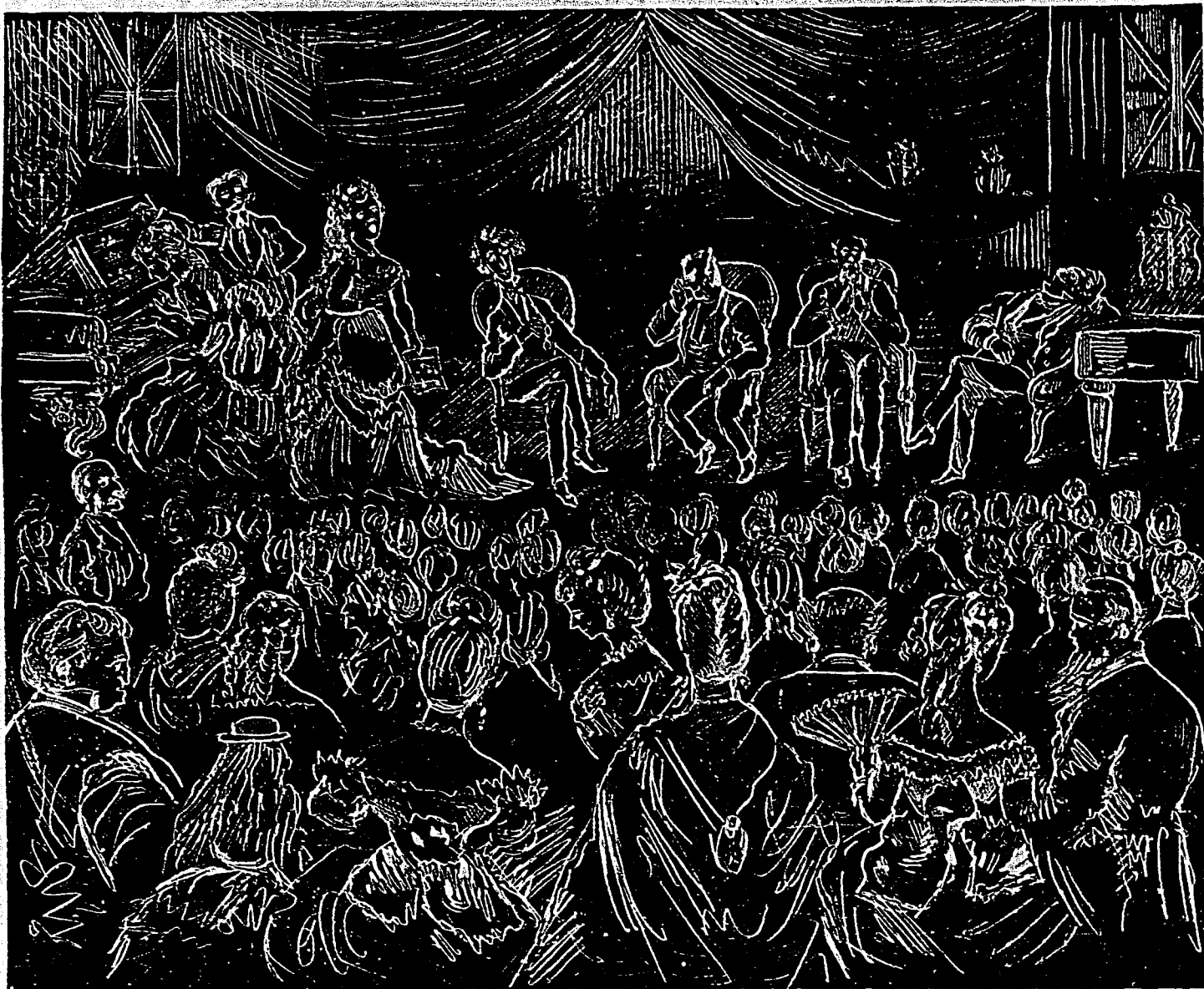
A SILHOUETTE BY GAS-LIGHT, OTTAWA, APRIL 20.