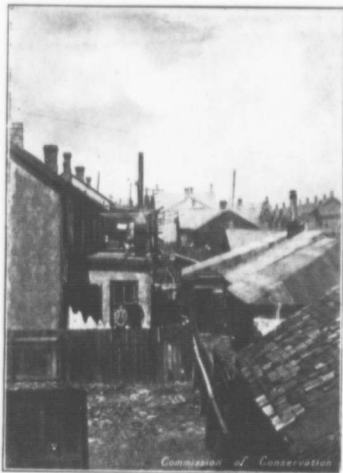
(Cut No. 46)