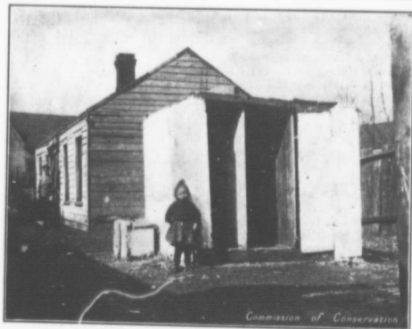
(Cut No. 48)