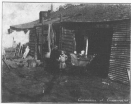
(Cut No. 47)