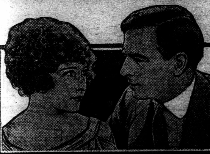
Anna Q. Nilsson and Milton Sills in 'Flowing Gold'