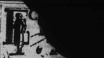
THE BOUFFANT MODE.

Forms of two-inch planks are put up to the height of about two feet and far enough apart to make the wall of the desired thickness. Common stone, either flat or round, is used. Fill in the larger ones against the planks on each side, and throw in smaller ones to fill up the interstices. After the stones are put into the depth of about a foot, the wall is slushed on top with concrete or cement, sand and gravel. Skilled labor is not required to lay the stone, as the planks keep the sides straight. The stone occupies more than half of the space, so that less than half the usual amount of concrete is required for the wall. When the walls set, the planks can be shoved up; thus, two feet more of wall can be built without going to the expense of buying plank for the entire height of the wall. The wall can be smoothed up by pointing up the holes, if any are left after the planks are removed.