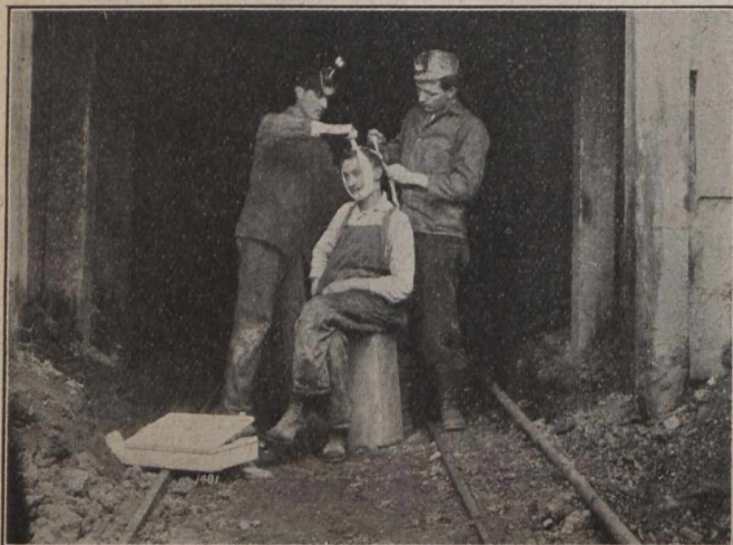
First Aid to the injured—bandaging for injury to jaw.

The JOURNAL hopes that when our own Mines Branch Testing Station is completed some such public exhibition can be arranged.