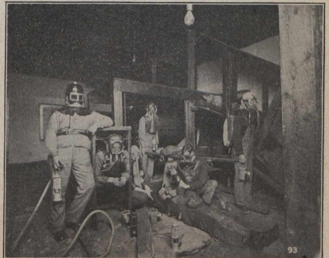
Interior rescue room Bureau of Mines Station.