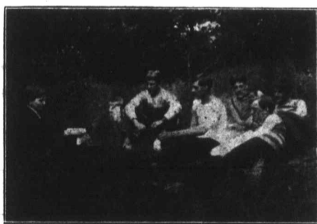
Taken with a Brownie.

A. CLUBB & SONS, 49 King St. W., TORONTO