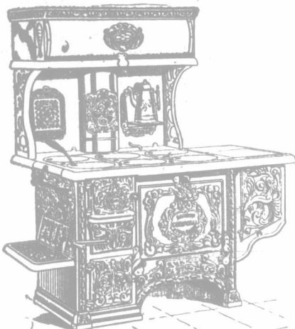
"CORNWALL" STEEL RANGE.

Most furnaces and ranges are built for general use, and sold indiscriminately in both city and country.