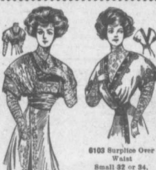
6103 Surplice Over

Patterns 10 each. Order by number and size. If for children, give age; for adults, give bust measure for waists, and waist measure for skirts. Please send orders to the Pattern Department.