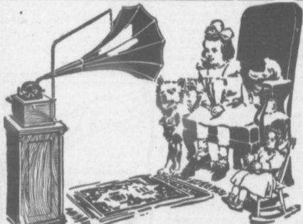
At the Christmas Matinee

D ID you ever see the face of a child when it is absolutely happy? It is a wonderful thing to make a child happy. If an Edison Phonograph had no other mission than to entertain the children it should be found in every home where there is even one child. But the Edison Phonograph is not merely a children's plaything, though it is the best playfellow a child can have. A child plays with its other playthings—but the Edison Phonograph plays with the child.